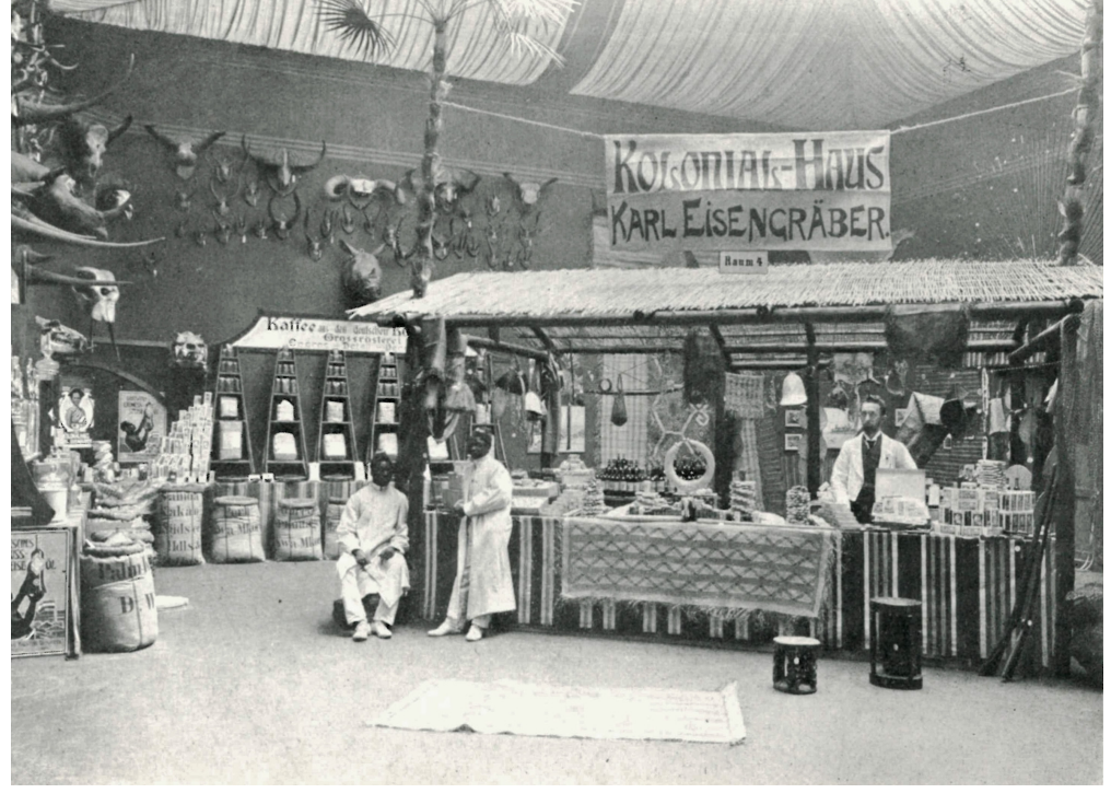
Photograph from the 1903 Offizieller Katalog der Deutsch-Kolonialen Jagdausstellung (Karlsruhe: G. Braunschen Hofbuchdruckerei, 1903: 62-63) showing ethnographic objects and animal trophies side by

Displaying wild animals as colonial appropriation